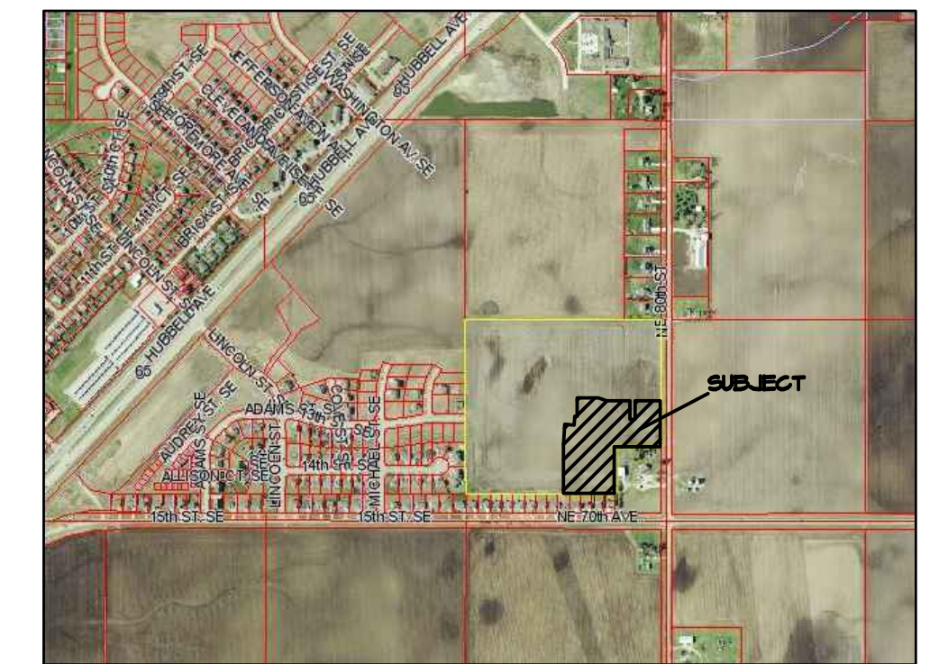
VICINITY SKETCH NO SCALE

PROPERTY OWNER: INTEGRITY LAND DEVELOPMENT, LLC. 5155 CROSS CREEK LANE WAUKEE, IOWA 50263 CONTACT: BRIAN CURNES 515-771-4090